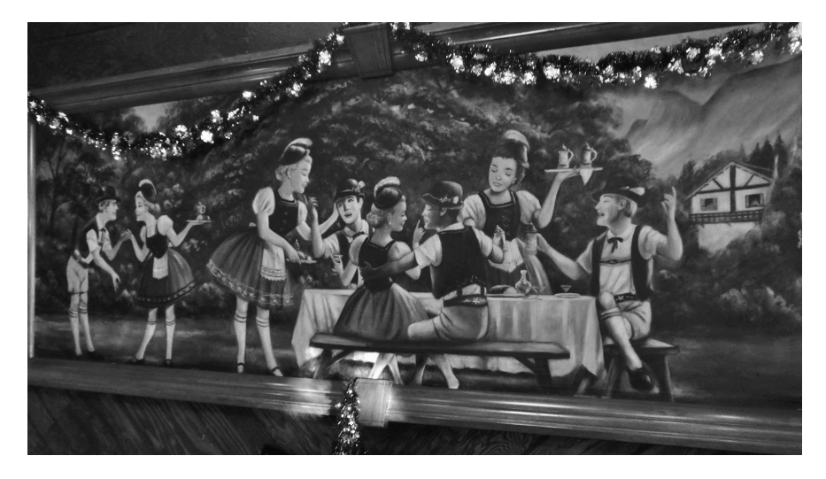
Lautenschlager, Painted 1961, Jansen's, Bowen St

Union on the campus of UWO had a mural, but it was lost when the building was razed.