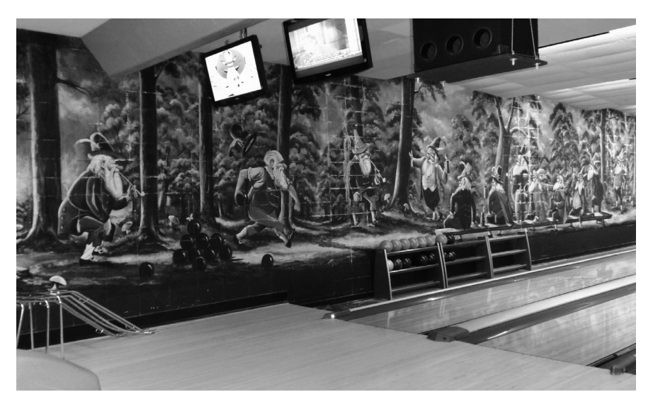
Lautenschlager Mural at Shoreview Lanes

One of his more impressive works can still be seen today. In 1960's, Lautenschlager was contracted to paint a wall length mural at Shoreview Lanes on Murdock.